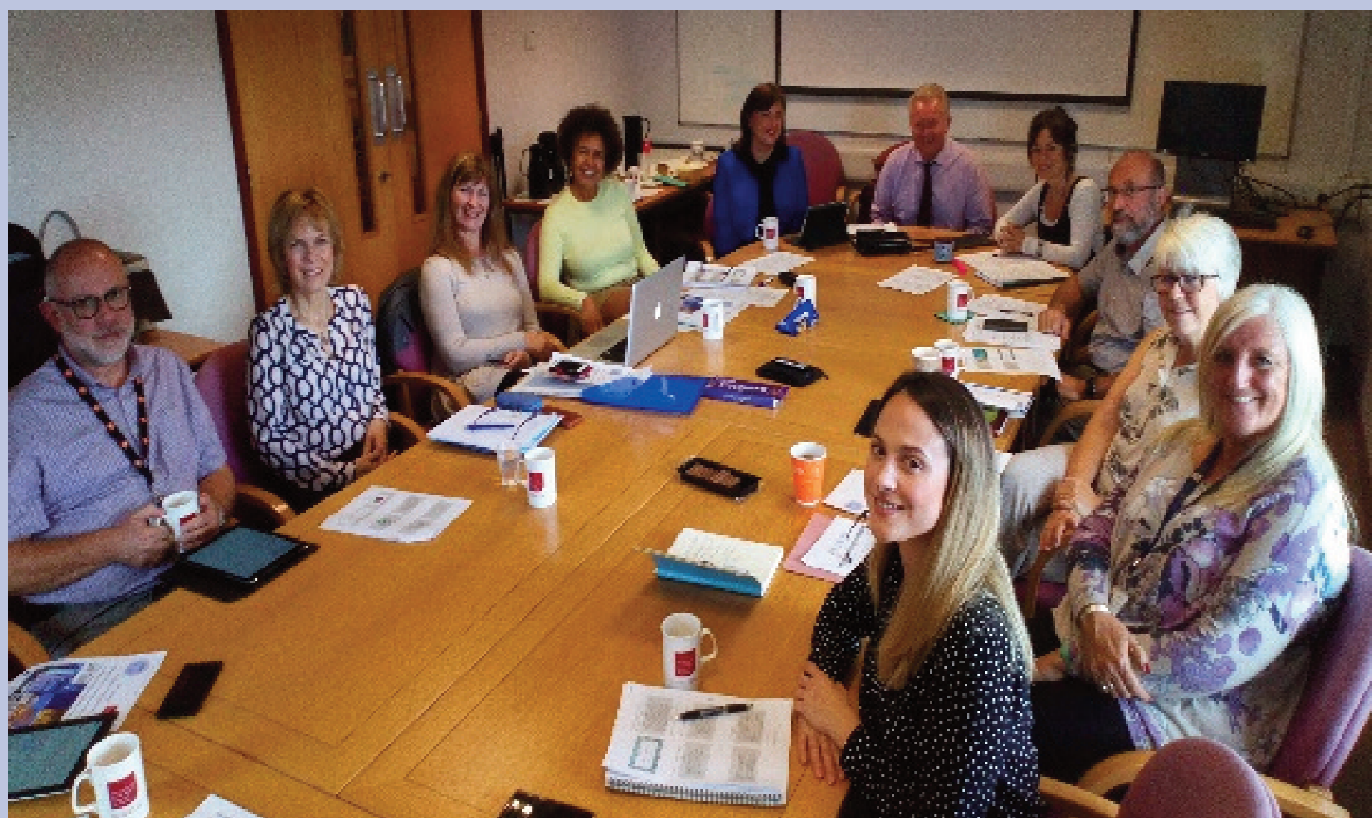
All Wales Spirituality Health and Wellbeing Group (SHaW)