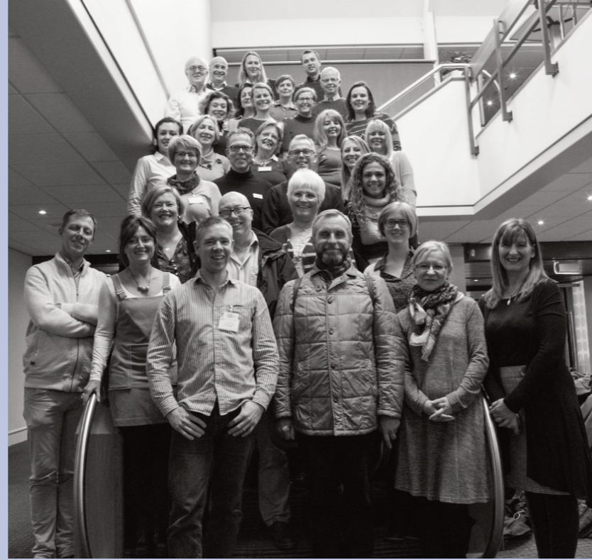
EPICC participants from across Europe